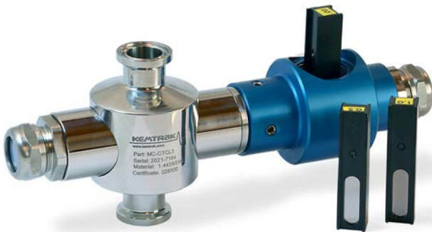
Integrated NIST validation accessory

Industrial grade measurement cells with scratch resistant sapphire windows, contain no electronics or moving parts making them ideal for both ordinary and hazardous area use. A validation & calibration accessory traceable to NIST standards is available to assure measurement confidence while saving valuable time and resources.