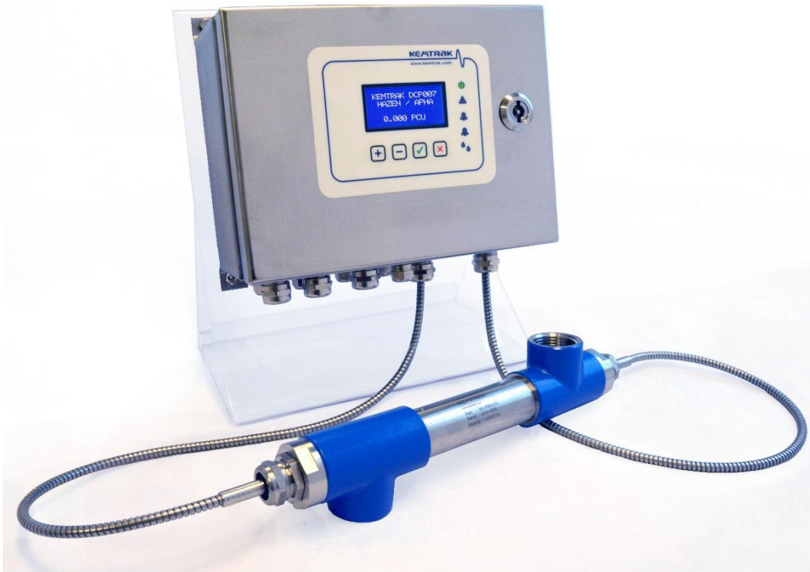
Below: Kemtrak DCP007 photometer system complete with stainless steel long pass (OPL = 200mm) measurement cell.