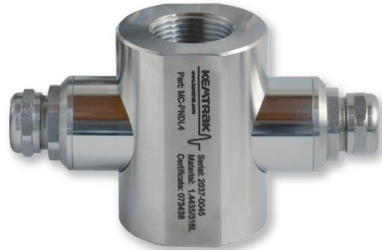
Above: Kemtrak stainless steel NPT 1" tapered pipe thread measurement cell with sapphire measurement window.

PCU = Pt-Co / Platinum Cobalt color Unit