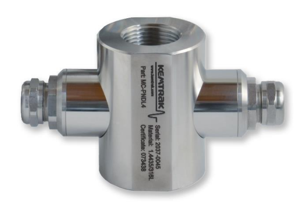
PCU = Pt-Co / Platinum Cobalt color Unit

Above: Kemtrak stainless steel NPT 1" tapered pipe thread measurement cell with sapphire measurement window. Below: Kemtrak DCP007 photometer system complete with stainless steel long pass (OPL = 200mm) measurement cell.