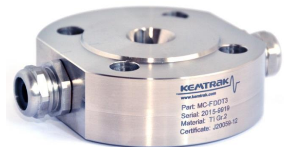
Kemtrak DCP007 process photometer DIN DN25 Titanium Gr 2 measurement cell

Due to the aggressive nature of chlorine dioxide, all wetted parts are manufactured from corrosion resistant materials, such as titanium Gr 2 and sapphire. The recommended measurement cell for this application is a DIN DN25 or ANSI 1" 150lb installed in a bypass line where water is available to zero the instrument.