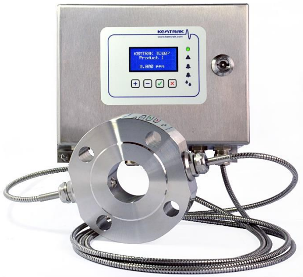
Above: Kemtrak TC007 industrial turbidimeter with a DIN DN25 measurement cell