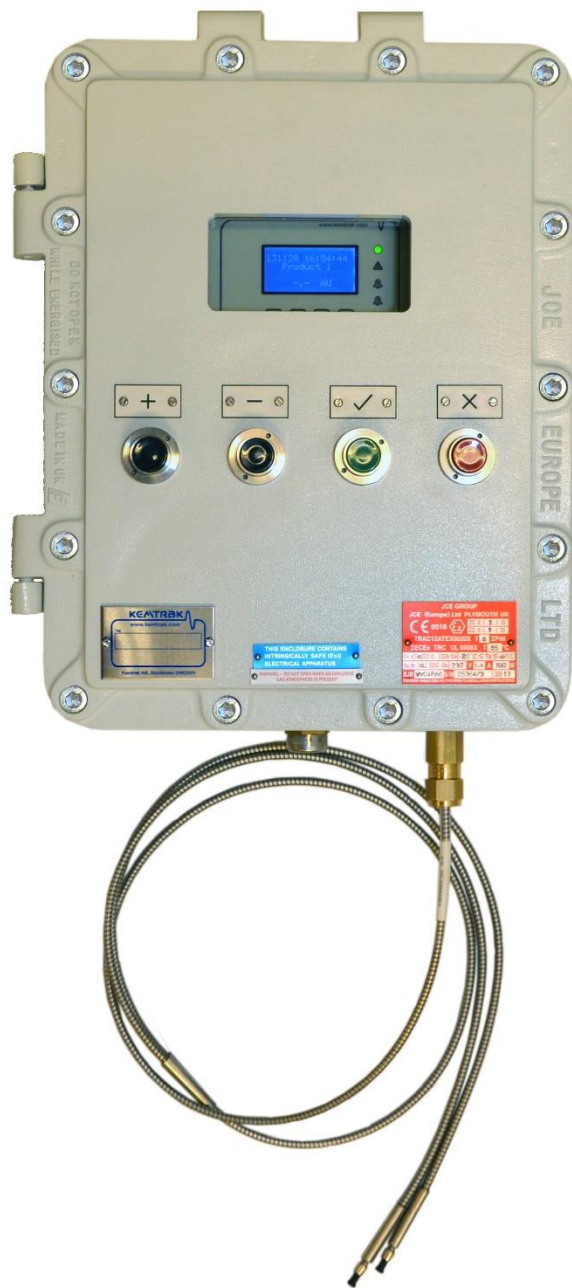
Right: Kemtrak TC007 industrial turbidimeter housed in an ATEX EExD zone 1 explosion proof enclosure