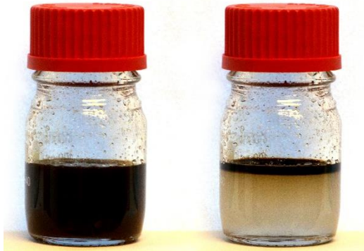
5% light crude oil in water Left: directly after shaken (turbid flow); Right: after five minutes.

As crude oil will not mix with water, it is essential that the sample under analysis has a turbulent flow to ensure sample homogeneity.