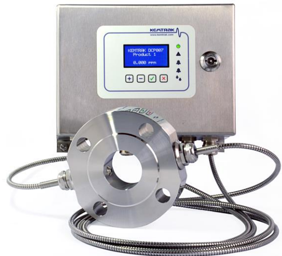
Figure 3: Kemtrak DCP007 NIR photometer with DIN DN50 measurement cell.

Turbid emulsions are accurately measured using the reference wavelength of a Kemtrak DCP007 NIR photometer, allowing both dissolved and suspended water to be monitored. Alternatively, a Kemtrak TC007 turbidimeter is suitable for monitoring water at concentrations above the solubility point. The instruments are calibrated in units of ppm water, providing an accurate measurement of the water content of the sample.